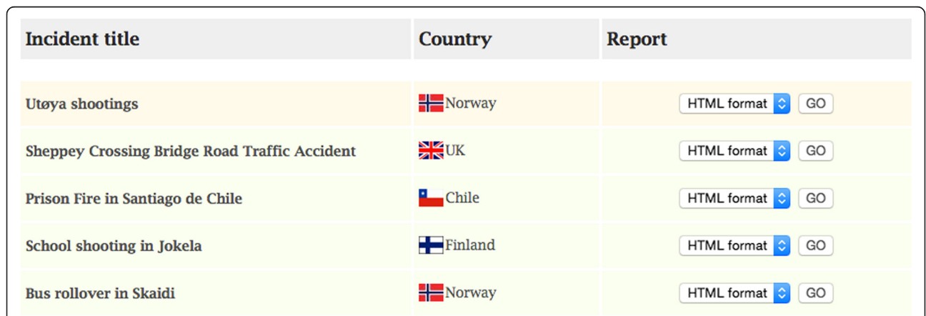
Fig. 2 Overview of published reports on majorincidentreporting.org

The main challenge so far has been the time delay in receiving completed reports. Currently, five reports have been published (c.f Fig. 2, Table 1). Preliminary results from a qualitative feasibility study suggest a need for revision and reducing the volume of work necessary for completing a report (Fattah S, Agledahl KM, Rehn M, Wisborg T: Experience with a novel global open access template for major incidents: qualitative feasibility study. Submitted). Dissemination of published reports has been done through